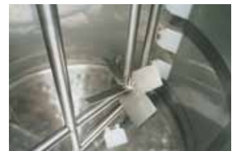
Scraper and Turbine Agitator