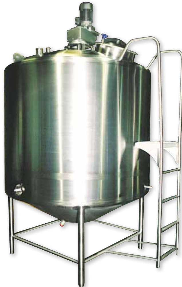
Cone Bottom Jacketed Process Tank