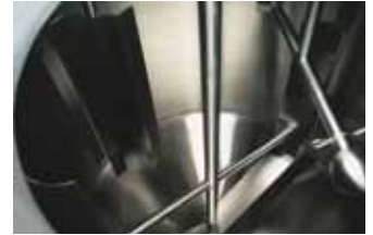
Side and Bottom Sweep Agitator