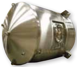
Insulated Process Tank