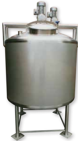
2B mill finish