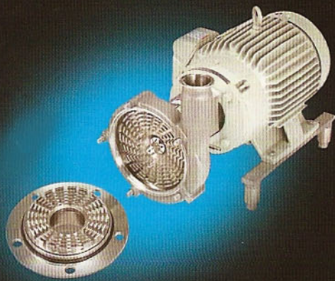
FS Series Shear Blenders