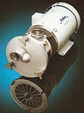
FZX Series Liquid Ring Pumps